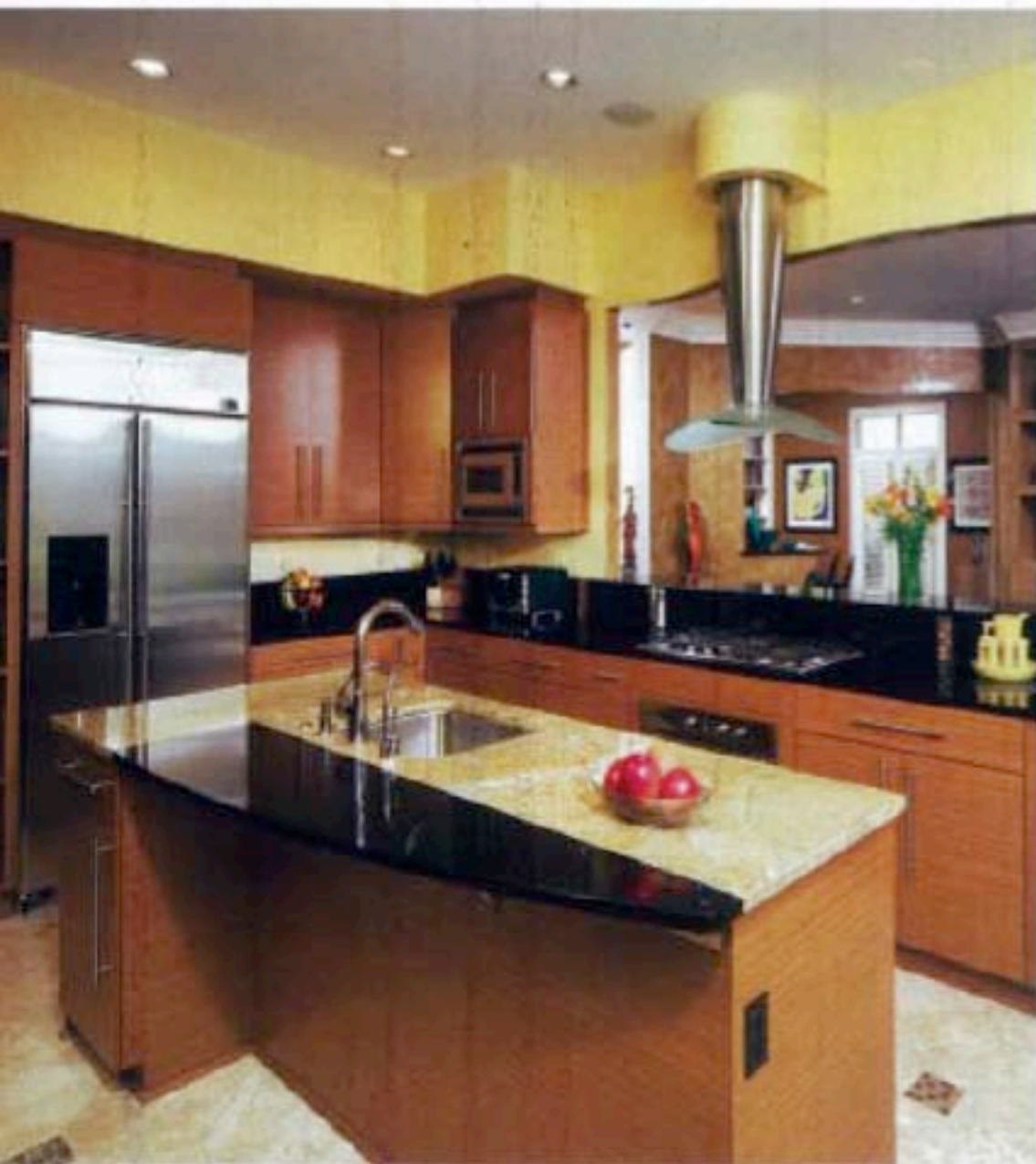
GE Monogram stainless steel appliances were used throughout the kitchen.

GE Monogram appliances were used in the kitchen, one perk being that the handles match the drawer and cabinet pulls. In addition to this stainless steel, Turner suggested the use of stainless on two drawer fronts to break up the stretch of teak along the long wall. "It was a great idea and really gave the kitchen that extra customized look," says Judy.