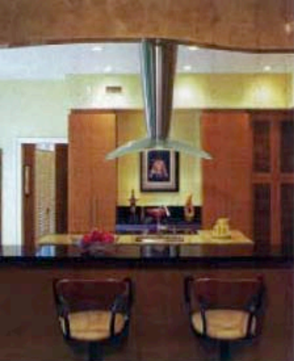
The Zephyr range hood with the curved support beam is a distinctive feature that stands out in this stylish kitchen.

of the homes they own. With their Potomac home, the goal was to update the dark kitchen, replace broken appliances, add a bar, and create a more communal space between the kitchen and family room.